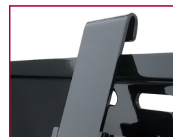
Easy hook-on design