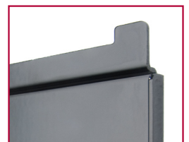
Specially designed safety tabs for secure support