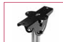
Ceiling Plate Cathedral Accessory, MOD-CPC