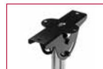
Ceiling Plate Cathedral Accessory, MOD-CPC