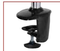
LCT620AD's Clamp on base easily clamps to edge desk or counter top