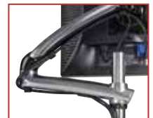
Cable management keeps a clean appearance