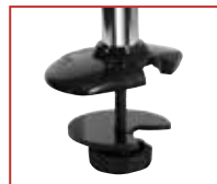
LCT620AD-G's Grommet base works with through holes in the desk or counter top