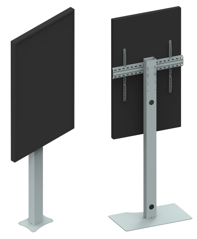
BOLT DOWN Version

Max VESA: 600x400 (for screen in Landscape mode) Max VESA: 400x600 (for screen in Portrait mode) Black painted iron (RAL9005)