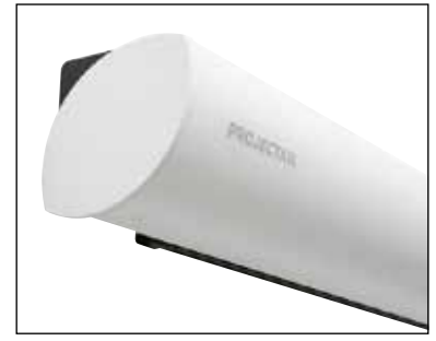
Leaf shaped case design