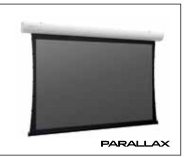
Now available with Parallax Ambient Light Rejecting option