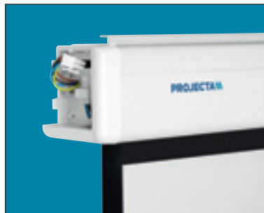
Plug and Play accessories