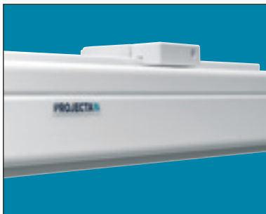
Easy Install with plastic mounting brackets