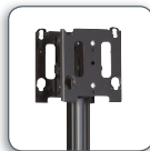
MF2™ Dual Back-to-Back Floor Stand