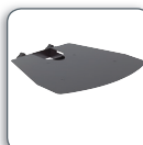
PAC710 ■ Accessory Shelf