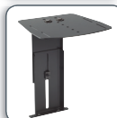
PAC715 ■ Video Conferencing Camera Shelf

For a complete list of cart & stand accessories see page 88 - 89.