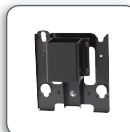
MAC720 ■ Dual Display Accessory